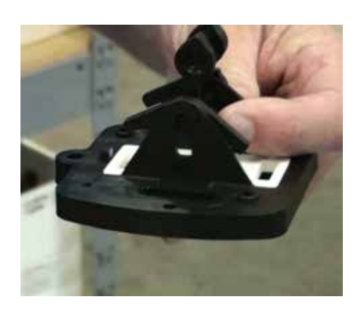
Step 8: To replace, insert the new rocker.

Step 7: To remove the rocker, spread the supports and pull it up.