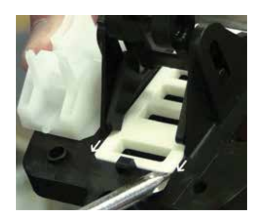
Step 9: Align the arrow on the slider with the two arrows on the actuator plate and install the new slider.