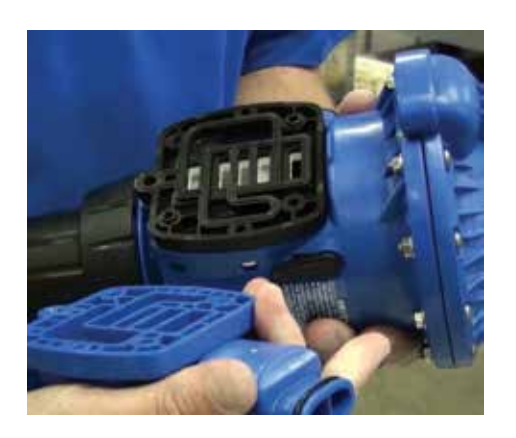
Step 2: Lift it out and remove.

Step 1: If the unit isn't clicking, unscrew and remove the 6 screws from the outlet plate assembly.