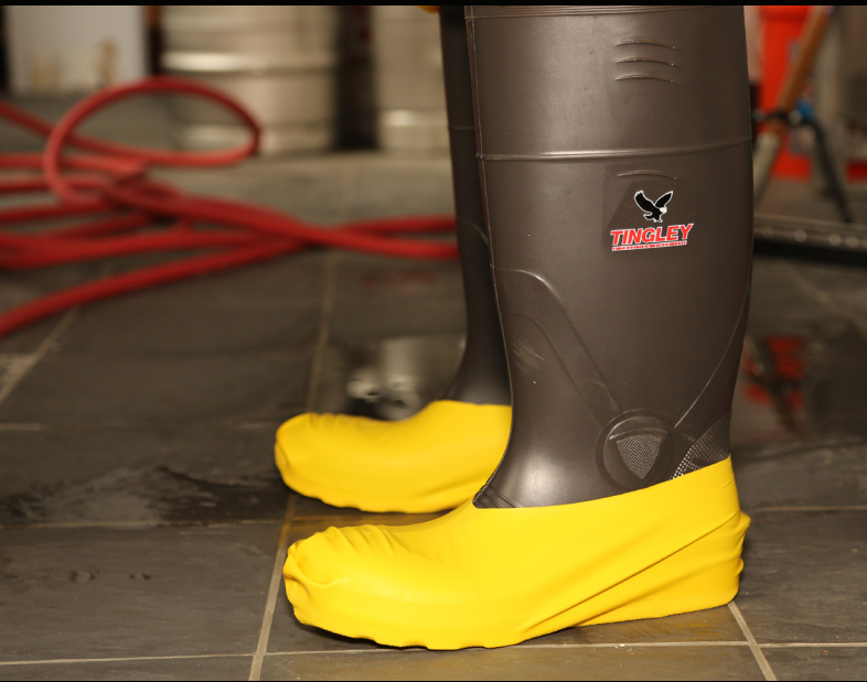
Boot Saver shoe covers are perfect for the color coded world of food processing by helping prevent cross-contamination.